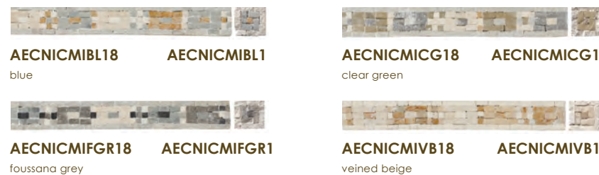
AECNICMIBL18 blue AECNICMIBL1 AECNICMICG18 clear green AECNICMICG1 AECNICMIFGR18 foussana grey AECNICMIFGR1 AECNICMIVB18 veined beige AECNICMIVB1