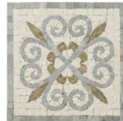
AECNICFOBL8 blue with blue border