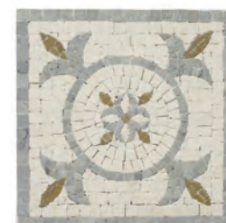
AECNICFLBL8 blue with blue border