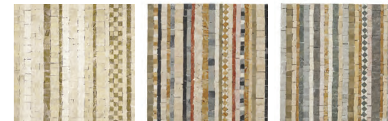
AECNICNJMM8 matmata AECNICONJMKO8 korbus AECNICONJMME8 medina