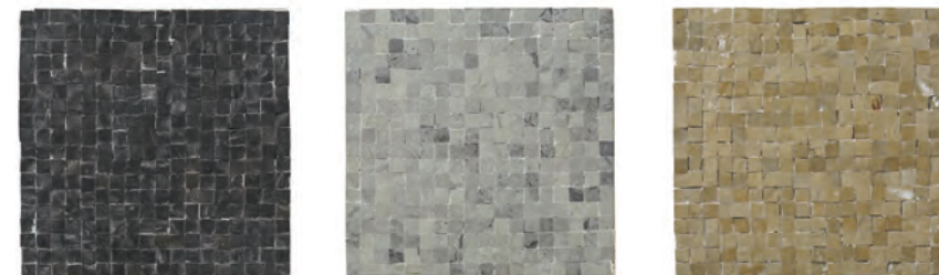
AECNICMOSBK8 black AECNICMOSBL8 blue AECNICMOSCG8 clear green