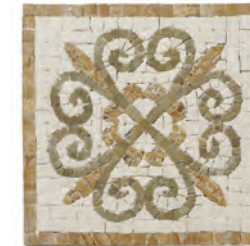
AECNICFOVB8 veined beige with clear green