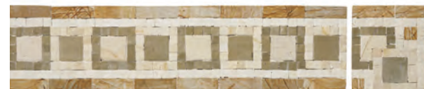
AECNICSQUVB416 veined beige AECNICSQUVB44C