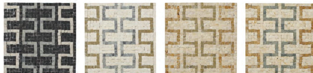
AECNICBINBK8 black AECNICBINBL8 blue AECNICBINC8 clear green AECNICBINVB8 veined beige