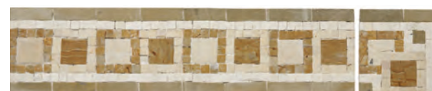
AECNICSQUCG416 clear green AECNICSQUCG44C