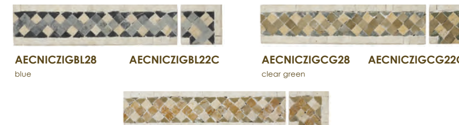
AECNICZIGBL28 blue AECNICZIGBL22C AECNICZIGCG28 clear green AECNICZIGCG22C AECNICZIGVB28 veined beige AECNICZIGVB22C