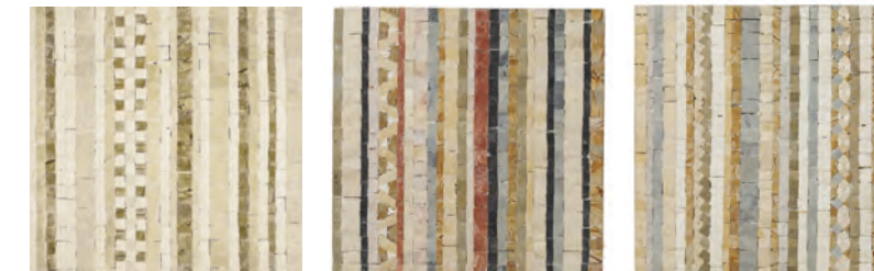
AECNICNJMBE8 berber AECNICONJMK8 kapsa AECNICONJMS8 ksar