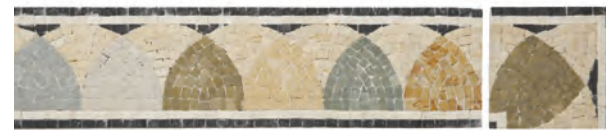
AECNICDAMML416 melange AECNICDAMML44C