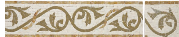
AECNICATHCG416 clear green