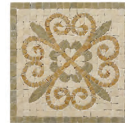
AECNICFOCG8 clear green with veined beige