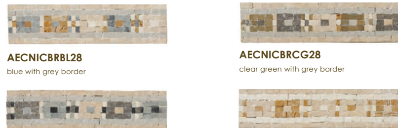
AECNICBRBL28 blue with grey border AECNICBRCG28 clear green with grey border AECNICBRFR28 foussana grey with grey border AECNICBRVB28 veined beige with melange border