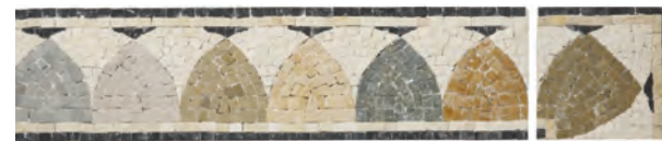
AECNICDAMWH416 white AECNICDAMWH44C