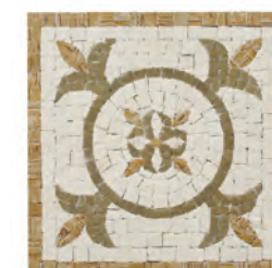
AECNICFLVB8 veined beige with clear green