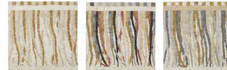
AECNICFRINGEBE8 berber/matmata AECNICFRINGEKO8 korbus/kapsa AECNICFRINGEME8 medina/ksar