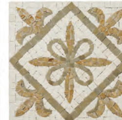
AECNICMOV88 veined beige