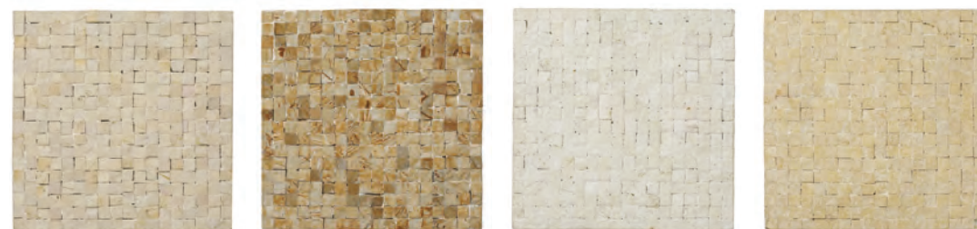
AECNICMOSML8 melange AECNICMOSVB8 veined beige AECNICMOSWH8 white AECNICMOSYL8 yellow