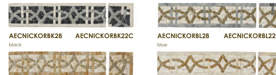
AECNICKORBK28 black AECNICKORBK22C AECNICKORBL28 blue AECNICKORBL22C AECNICKORCG28 clear green AECNICKORCG22C AECNICKORVB28 veined beige AECNICKORVB22C