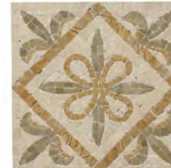
AECNICMOCG8 clear green