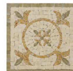
AECNICFLCG8 clear green with veined beige