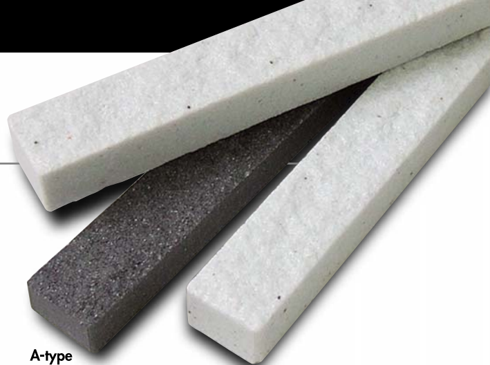
A-type Thickness 3/8"

SHIROKURO means white & black in Japanese. Simple but sophisticated looking border tiles enrich the atmosphere of interior.