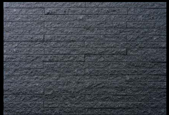
A-type=Thickness 3/8" SKA-02 B-type=Thickness 5/8" SKB-02