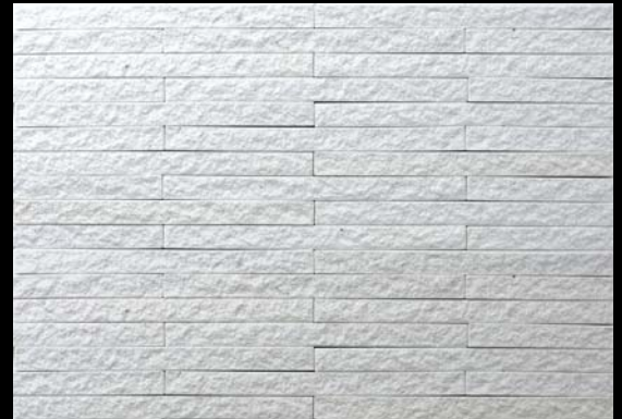
A-type=Thickness 3/8" SKA-01 B-type=Thickness 5/8" SKB-01